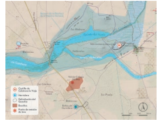
Work derived from Mapa-LiDAR 2019 CC-BY 4.0 scne.es - Fig. 3